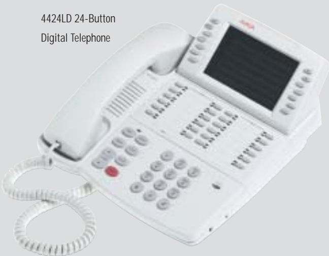
4424LD 24-Button Digital Telephone

Call accounting options provide you with a powerful tool for measuring and controlling telephone expenses. Call accounting systems allow you to set up account codes and generate a variety of printed reports that pinpoint the specific calling patterns of your business. This will help you monitor facility use, allocate phone charges, and detect toll fraud from outside parties. Call accounting software offerings that work with MERLIN MAGIX include eCAS and eCAS Lite.