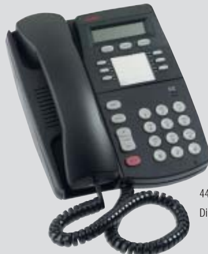
4406D 6-Button Digital Telephone

All MERLIN MAGIX phones are designed with the latest digital communications interfaces, providing clear, high-quality voice transmission. These phones can help make your everyday business communications easy, cost-effective and productive.